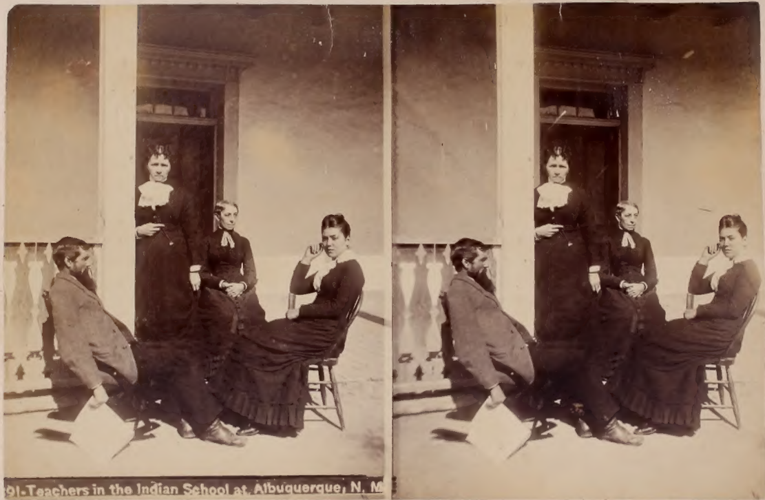
91-Teachers in the Indian School at Albuquerque, N. M.